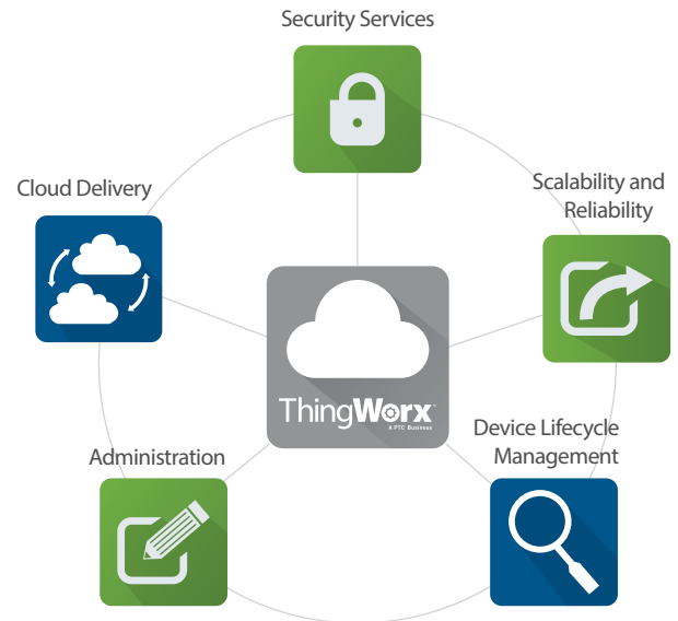
Figure 4: Reduce Upfront Costs, Drive Down Operational Costs, and Minimize Risk

Several manufacturers provide their clients with Web applications that allow the users to remotely control and monitor the consumables on a machine in order to replenish them in a timely manner. Others supply applications that audit all machine activity and make it easy to generate compliance reports.