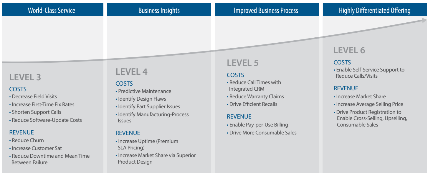
Figure 3: ROI at Each Level of the Value Curve